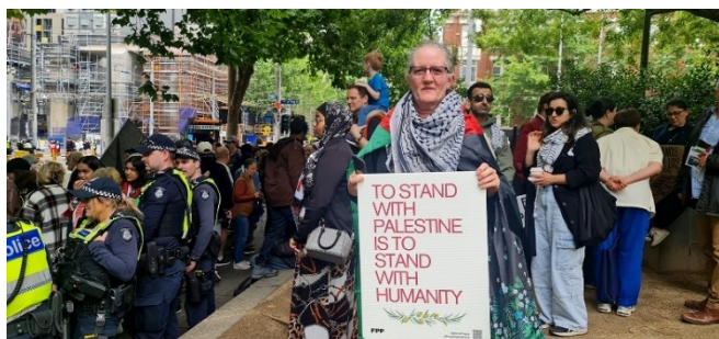
Melbourne, December 2023