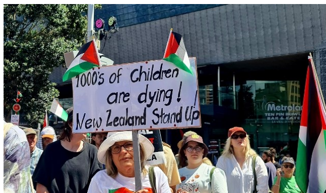
Auckland 14 January 2024